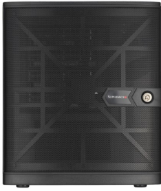
(Rear View – System)